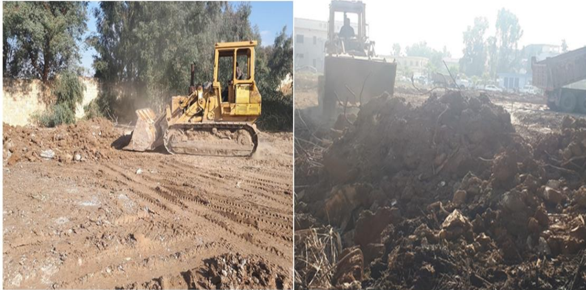
Figure 4. The process of cladding the sides of the trocar near the publishing house inside the university

Many studies have been conducted on the reuse of concrete residues for engineering purposes, especially civil engineering works [20-23]. a field study was conducted to investigate the performance of pavement composed of concrete, asphalt mix, and ceramic waste aggregate [24]. The study analyzed the performance of a road surface course based on the values gained for the following variables: dry density, moisture, and deflections. The values obtained for a conventional road surface with a sub-base of quarry (natural) aggregate were compared to the values obtained for a road surface composed of recycled aggregate. It was detected that the load-bearing capacity of the recycled artificial CDW aggregate was acceptable and performs as well as natural quarry aggregate with some conditions. The study establishes that recycled aggregate made of concrete, ceramic material, and asphalt also had a lower density than natural aggregate. the use of ceramic tile rubble as a primary material was evaluated in road paving design [25]. The researchers explained that instead of disposing of it in landfills, ceramic tile waste could be used in highway engineering applications, and thus reducing its potential impact on the environment. The test results showed that adding waste ceramic tile residues increases the CBR value of the soil. The researchers also suggested the possibility of using ceramic waste