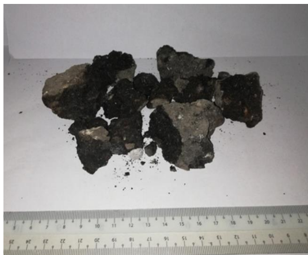
Figure 5. The asphalt materials rubble dumped in separate places in Mosul

Many evaluations and laboratory studies of the geotechnical, geological, and environmental properties of the solid wastes resulting from breaking and uprooting old or worn-out streets and roads have been carried out in previous studies. the potential reuse of used asphalt paving slag for full recycling and direct use was Investigated by [29]. The tests used to study the effect of used asphalt paving on the mechanical characteristics of recycled base materials taken from northern Utah in America were the free-tip oscillating shaft test to measure the stiffness and the CBR test for strength measurement. The results suggest in general, that the use of as