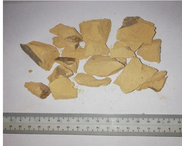
Figure 6. The bricks materials rubble dumped in separate places in Mosul

especially the old city and the nearby neighbourhoods because it was built before the left coast (the new part of the city) and before the blocks were used in construction. They were grouped into piles in the destruction areas. Figure 6 (a and b).