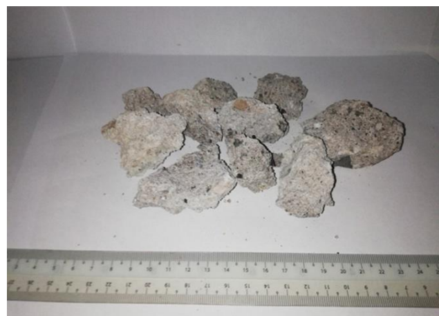
Figure 3. The rubble of concrete dumped in separate places in Mosul