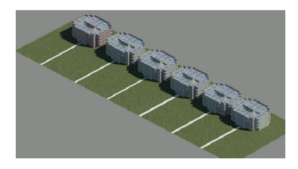
Figure 1: Rendering Site for Six Rise Buildings

3-2 Dead Load Generated from Using Lightweight Foam Concrete Bricks